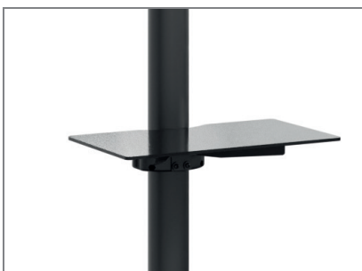
Optional: Braclabs-Stand Front shelf (Item no.: 1984)