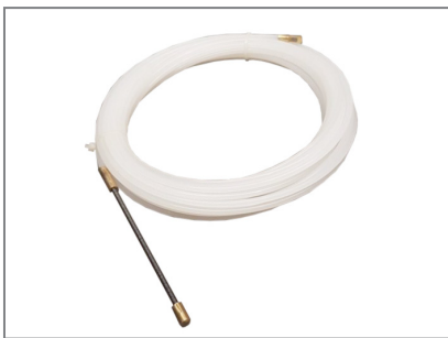
usefull cable pulling aid included

A mobile version (Item no.: 1983) and a version for floor-mounting (Item no.: 1982) is also available.