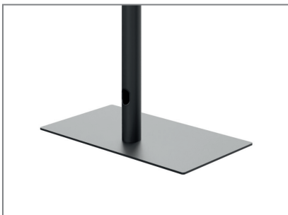
asymmetrical base allows positioning close to a wall